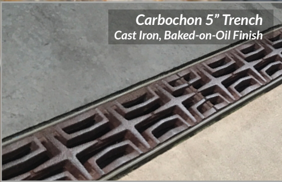
Carbochon 5" Trench Cast Iron, Baked-on-Oil Finish