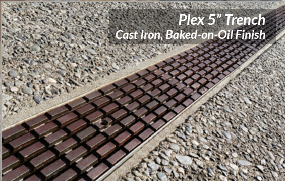
Plex 5" Trench Cast Iron, Baked-on-Oil Finish