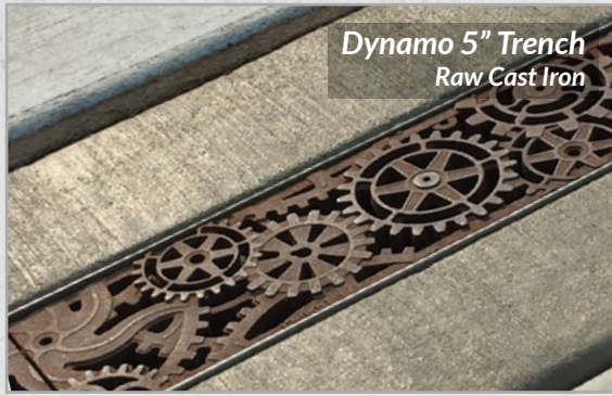
Dynamo 5" Trench Raw Cast Iron