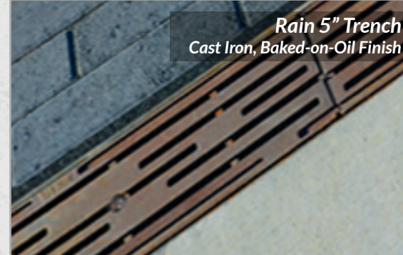
Rain 5" Trench Cast Iron, Baked-on-Oil Finish