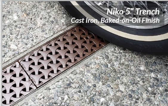
Niko 5" Trench Cast Iron, Baked-on-Oil Finish