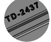
CASTING-ID scale 1:4