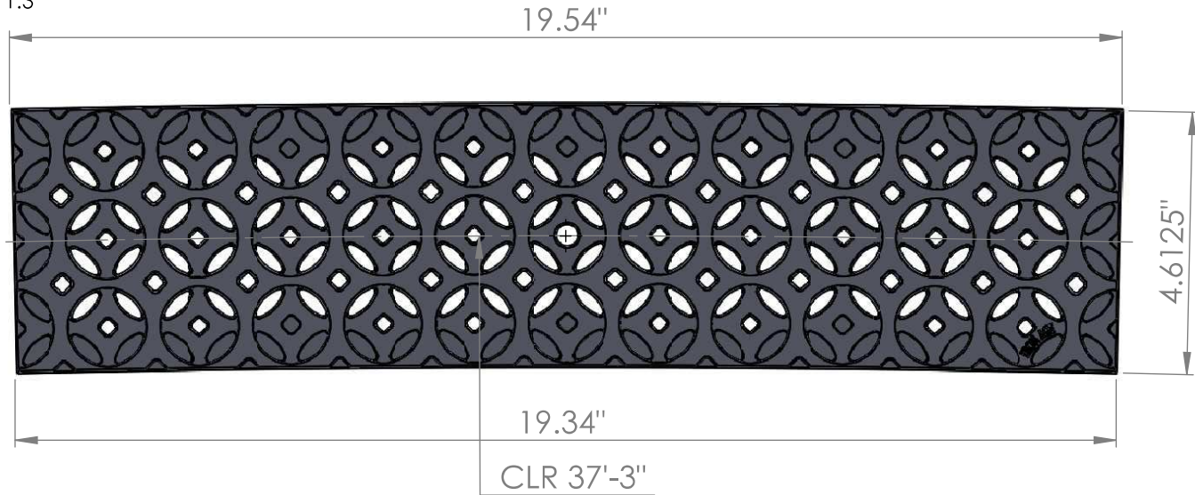
Top View Scale 1:3