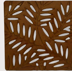
Locust 12" Sq. / NDS® 1200 Series 24" Sq. / NDS® 2400 Series