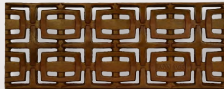
Carbochon (8" x 20")