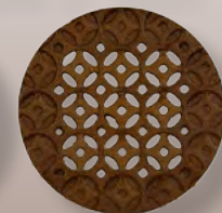
Interlaken 6" Dia.