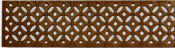
Interlaken (6" x 24")