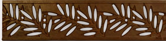
Locust (6" x 24")