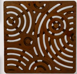
Oblio 12" Sq. / NDS® 1200 Series 24" Sq. / NDS® 2400 Series