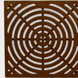
Bullseye 12" Sq. / NDS® 1200 Series