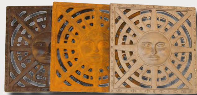
1 year ← 1 month ← Raw Cast Iron

Durable as they are beautiful, IRON AGE® trench and catch basin grates are designed to last a lifetime. Engineered to fit the most widely used drain bodies on the market today, our cast metal grates age gracefully and never need upkeep.