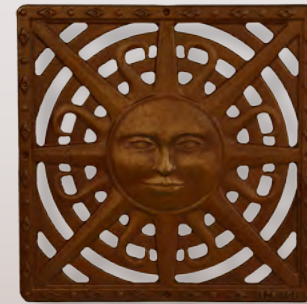
Sun 12" Sq. / NDS® 1200 Series