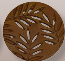
Locust 6" Dia.