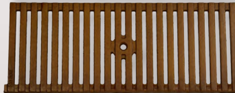
Regular Joe (8" x 20")