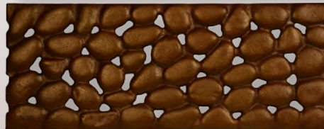
River Rock (8" x 20")