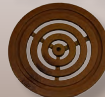
Bullseye 6" Dia.