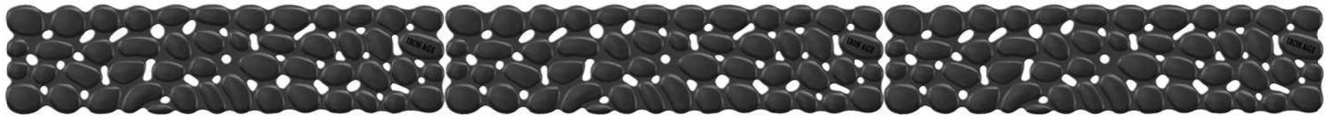
3 GRATES ARRAYED SCALE 1 : 6