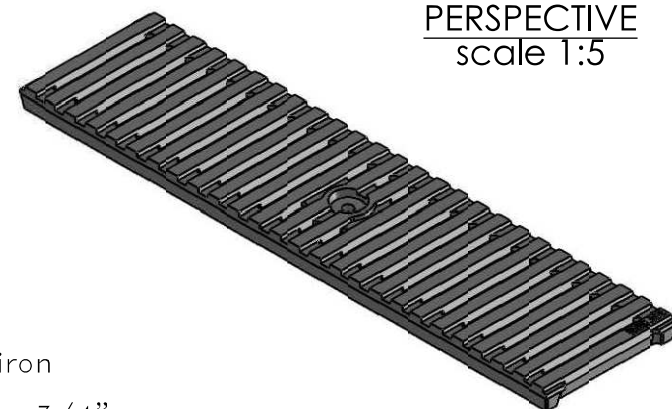
PERSPECTIVE scale 1:5