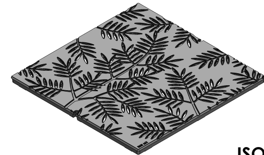
ISO-VIEW scale 1:15